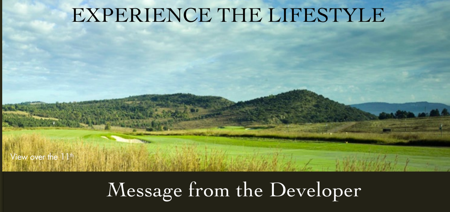
View over the 11 th