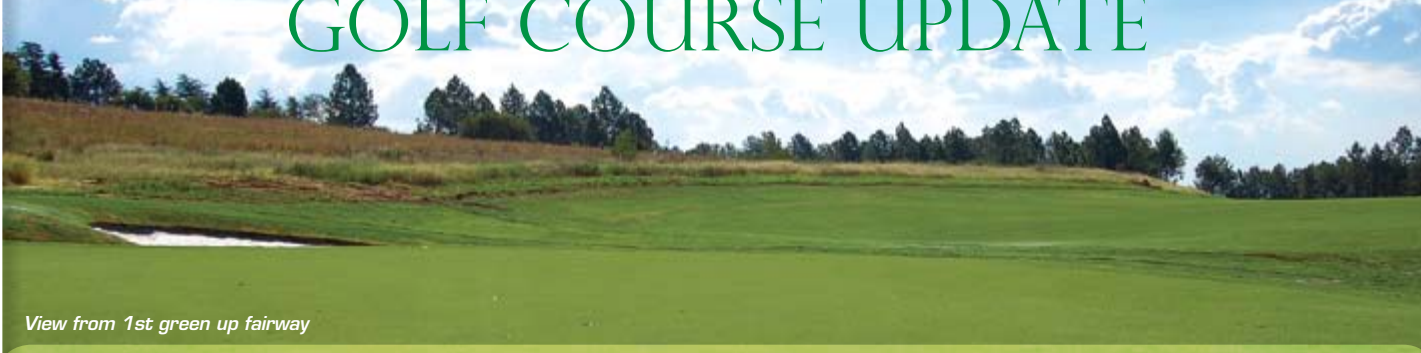
View from 1st green up fairway

The exclusively Greg Norman designed golf course is currently undergoing final touches, with the majority of the championship golf course well established and grow-in progressing rapidly. We are very pleased with recent progress but have elected to shift the opening of the course to November 2009. This will allow further maturity of the course and ensure the presentation, playability and experience are of the standards expected at Eye of Africa.