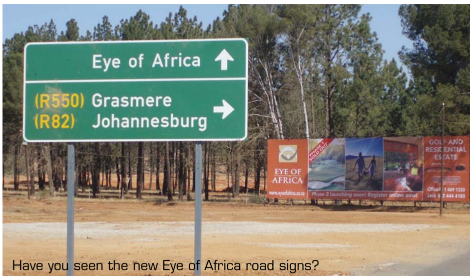
Have you seen the new Eye of Africa road signs?

Chief Operations Officer Medallist Developments