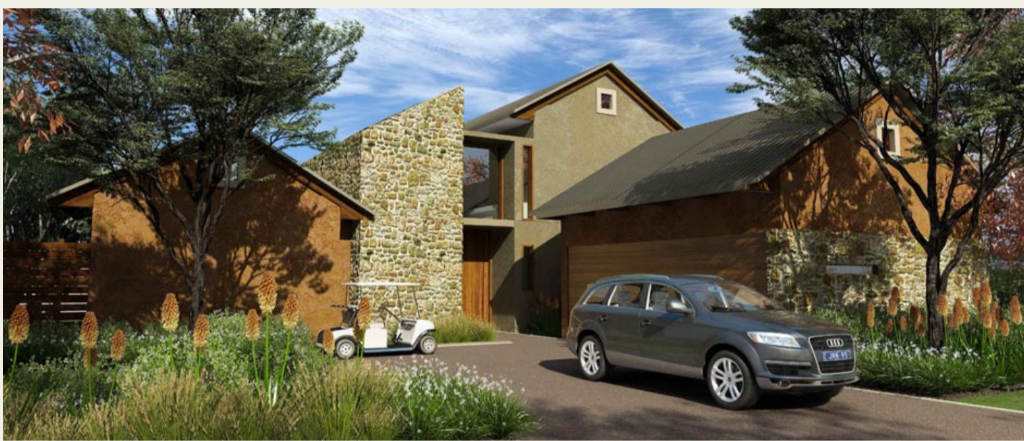
Images are indicative only.